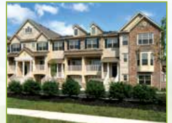
Heritage Pointe Village Way, Chalfont, PA 18914