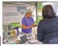
Farmar Day of SunFennel.