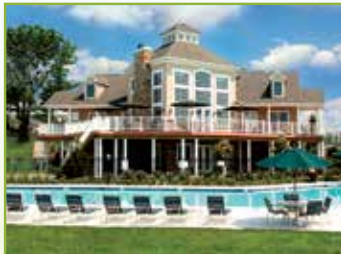
Heritage Orchard Hill - Clubhouse 1 Applewood Drive, Perkasie, PA 18944