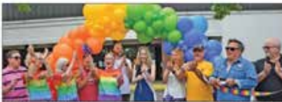
Members of the Perkasie community attend a ribbon cutting on the borough's Pride Day, June 26.