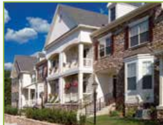
Heritage Greene 807 Ridgeview Court, Sellersville, PA 18960