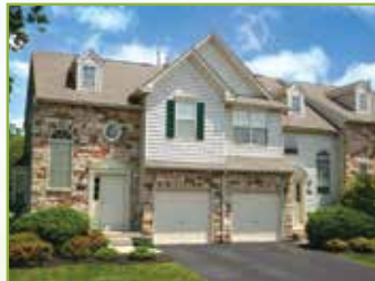
Heritage Summer Hill Signature Drive, Doylestown, PA 18902